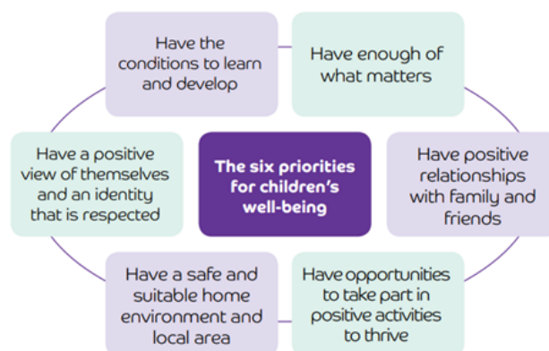
Figure 3: The six priorities for children's well-being

At the same time, we can think about ourselves too. How about a shared activity such as playing outside together or being creative such as, singing, dancing, mark making but most of all have fun!!!!